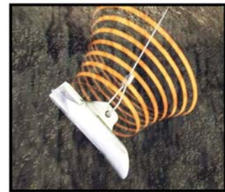
LOAD TEST IF DESIRED