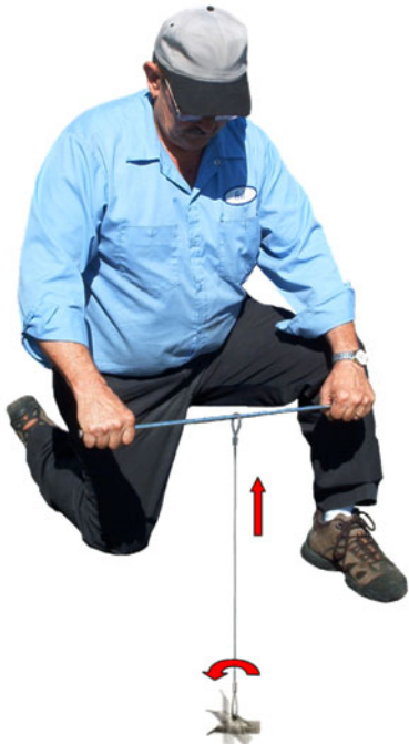
LOCKING WITH DRIVE STEEL

The smaller DUCKBILL models may be locked by hand. Insert the drive steel through the cable loop or wrap the cable around the drive steel to fashion a “T” handle. Pull on the drive steel to anchor-lock the anchor. A fulcrum is also very useful in locking anchors by hand. The DUCKBILL “hand hook” is also available.