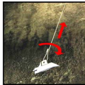
PULL TENDON TO LOCK ANCHOR