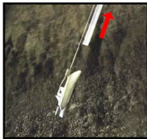
REMOVE DRIVE STEEL