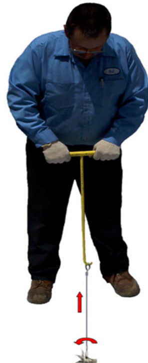
LOCKING WITH HAND HOOK